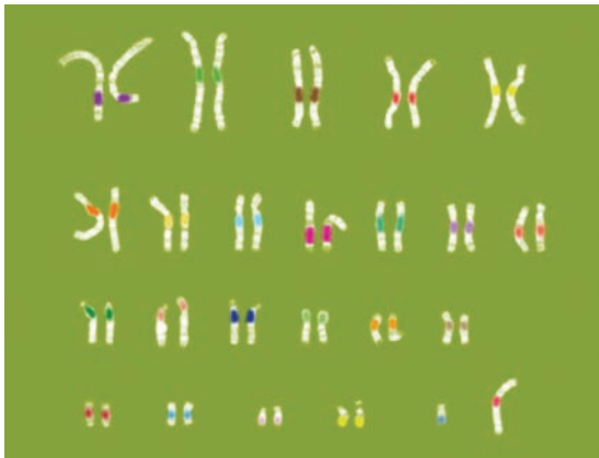
DNA extracted from the blood serves to analyse the chromosomal region where the involved gene lies and search for linked genetic markers that help characterize the different chromosomes and distinguish the mutated from the normal ones.