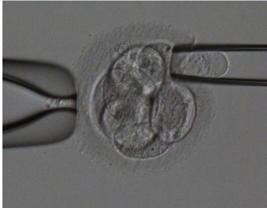
Testing the embryos for the mutation and the markers simultaneously is a more robust analysis than testing only for the mutation, and allows achieving a test reliability around 98%.

IVF with PGD is a very specialised assisted reproduction technique where a multidisciplinary team composed of gynecologists, embryologists and molecular biologists must work together in a coordinate way and under strict deadlines. During the IVF cycle, several eggs from the patient are retrieved after hormone stimulation. These are fertilized with sperm from the couple and one cell of each embryo is biopsied on day 3 of development in order to perform the genetic analysis. Results are obtained on day 5, so that only those embryos that did not inherit the genetic disease are transferred to the maternal uterus. Couples that wish to avoid transmitting a genetic disease to their offspring through PGD have to undergo an assisted reproduction treatment although they do not have fertility problems, as the embryos must be generated and diagnosed before implantation. The success of this treatment depends on several factors such as